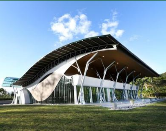
Doka Estate, official venue partner for the Women-Powered Coffee Summit 2023