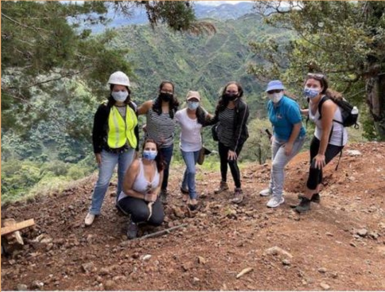
WECO 2023 Costa Rica Site Visit